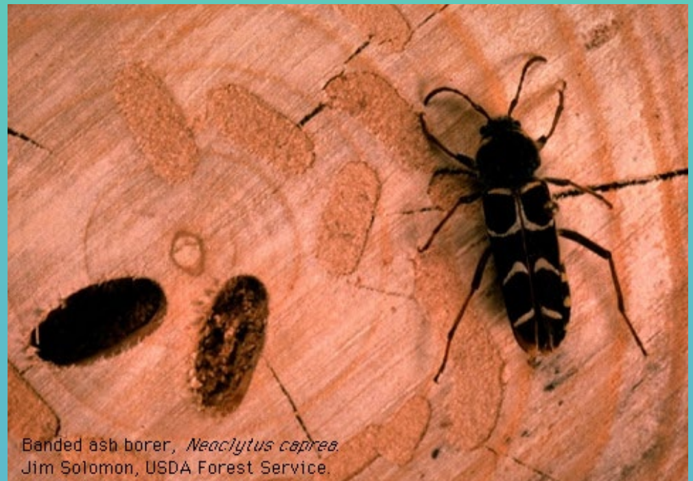
Banded ash borer, Neoclytus caprea .